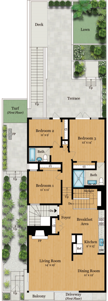
SECOND FLOOR 1,450 SQ FT